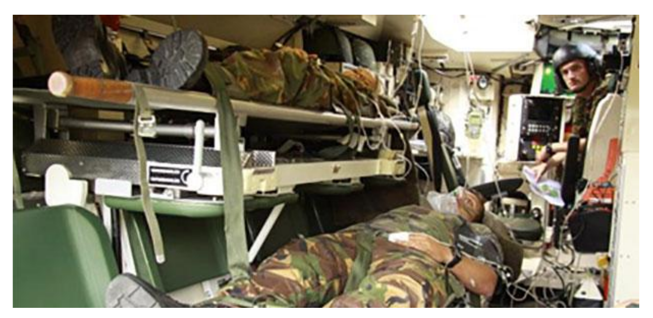
Marshall has experience of designing and implementing the layout of ambulances to maximize capacity whilst still allowing the medic space to perform life-saving actions.