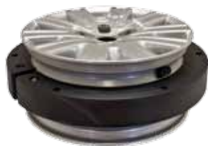
Heavy-Duty Wheel with the Rodgard BPX Runflat system