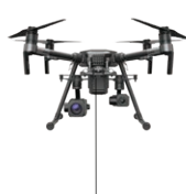
DJI M200 / M210