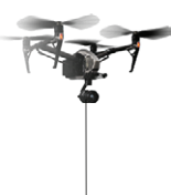
DJI Inspire 2